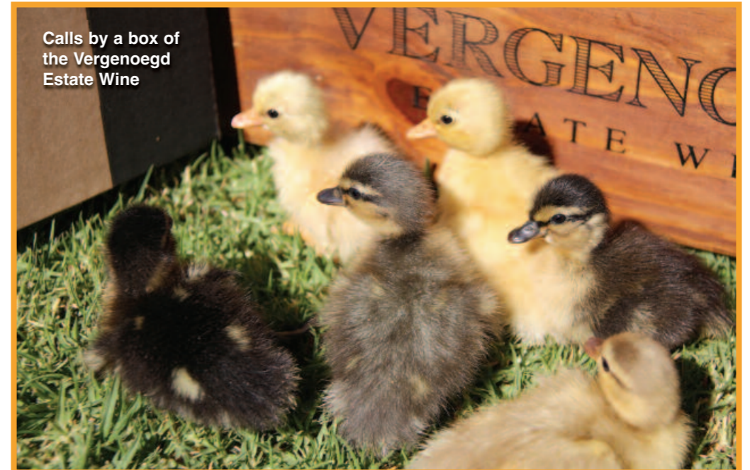
Calls by a box of the Vergenoegd Estate Wine