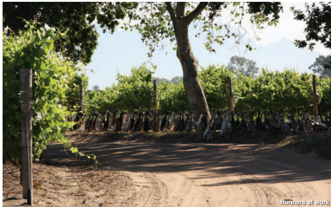
Runners at work

Websites with more information: www.runnerduck.net www.vergenoegd.co.za