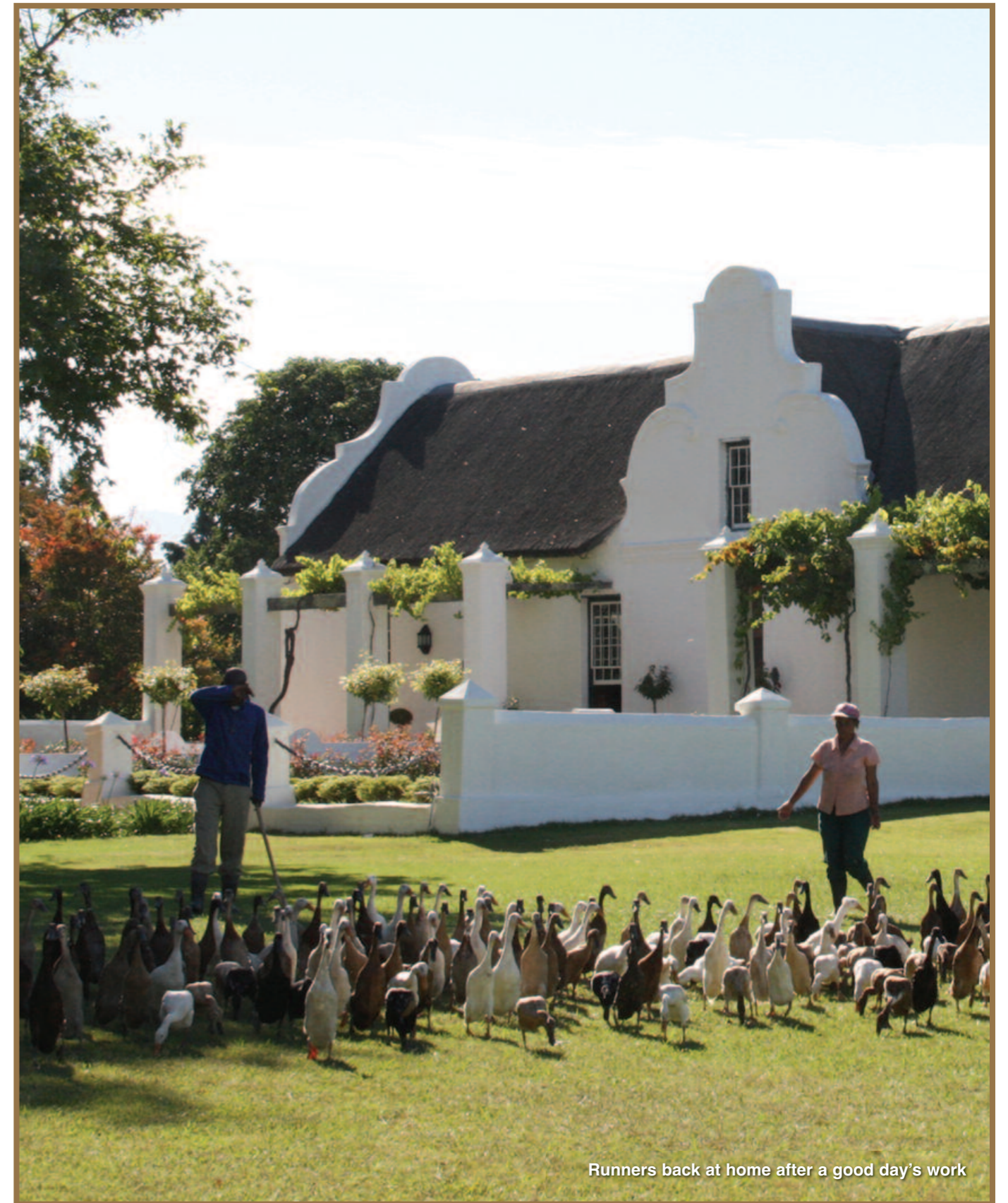
Runners back at home after a good day's work